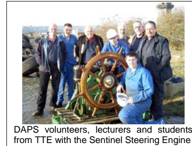
DAPS volunteers, lecturers and students from TTE with the Sentinel Steering Engine

On delivery to the TTE the process of unloading the windlass was reversed with the aid of the forklift truck completing in minutes what had taken over half an hour of physical labour.