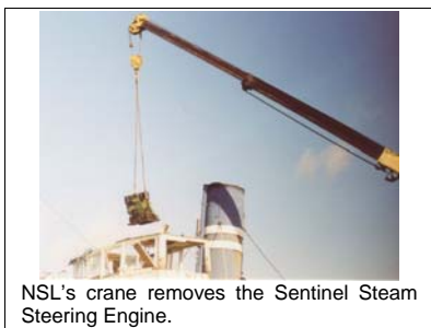
NSL's crane removes the Sentinel Steam Steering Engine.