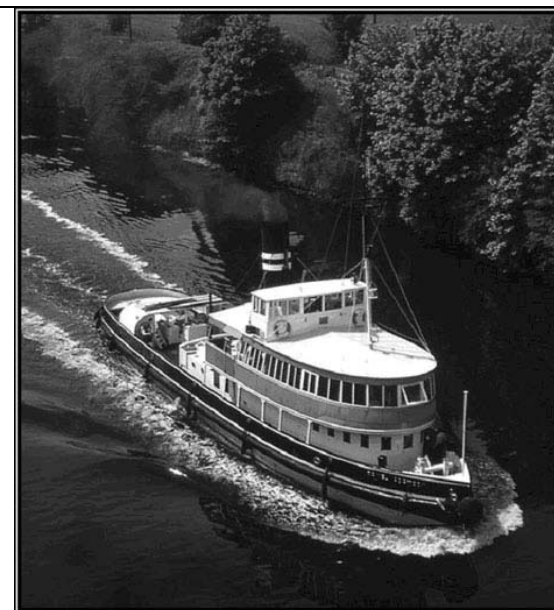
The "Daniel Adamson" approaching Warrington. 20 th May 1975.